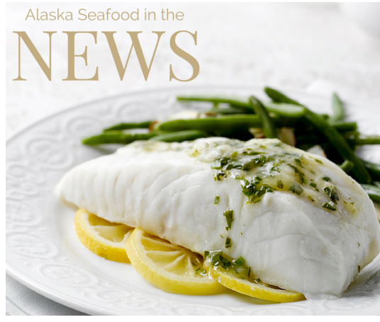
What to Cook this Week, New York Times, June 3, 2018