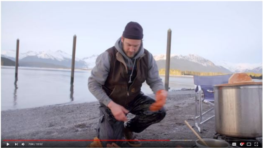
ITS ALIVE WITH BRAD S1 - E29 Brad Cooks Crabs in Alaska (Part 2) | It's Alive | Bon Appétit