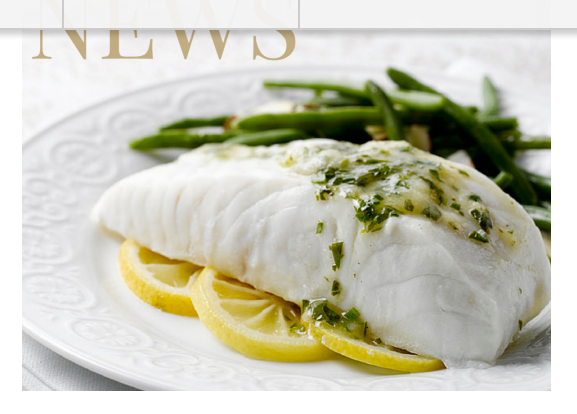
In 20 Minutes, Summer on a Plate with Salmon, Associated Press, April 25, 2018