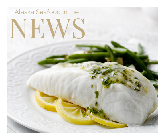
Cooking On Deadline, Associated Press, January 23, 2018

7 Healthy Grocery Items to Buy at Trader Joe's, Real Simple, January, 2018