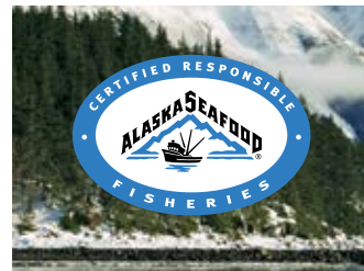
Acceptable logo use