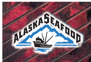
Unacceptable logo use