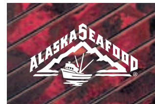
Acceptable logo use