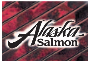
Unacceptable brandmark use