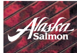
Acceptable brandmark use